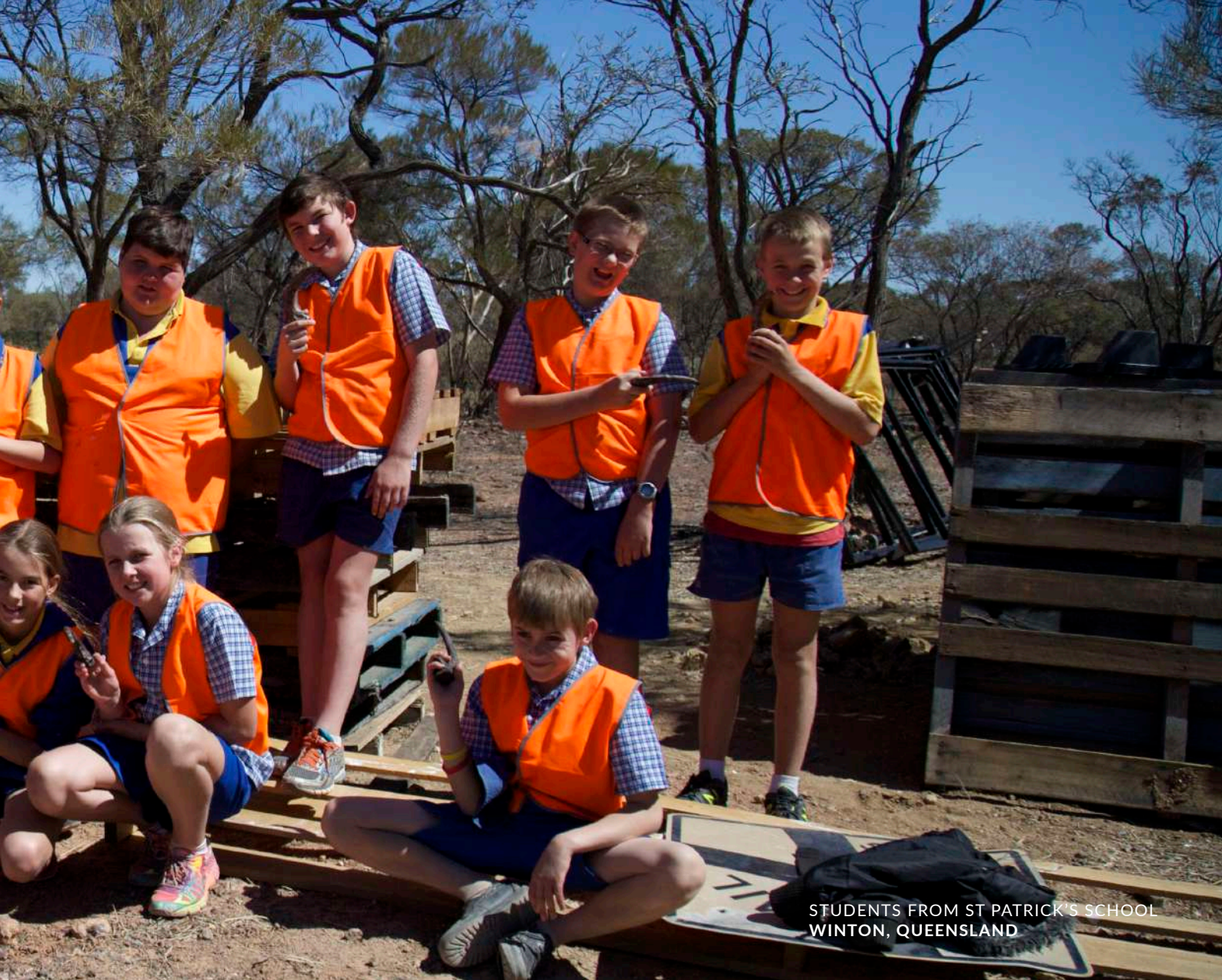
STUDENTS FROM ST PATRICK'S SCHOOL WINTON, QUEENSLAND