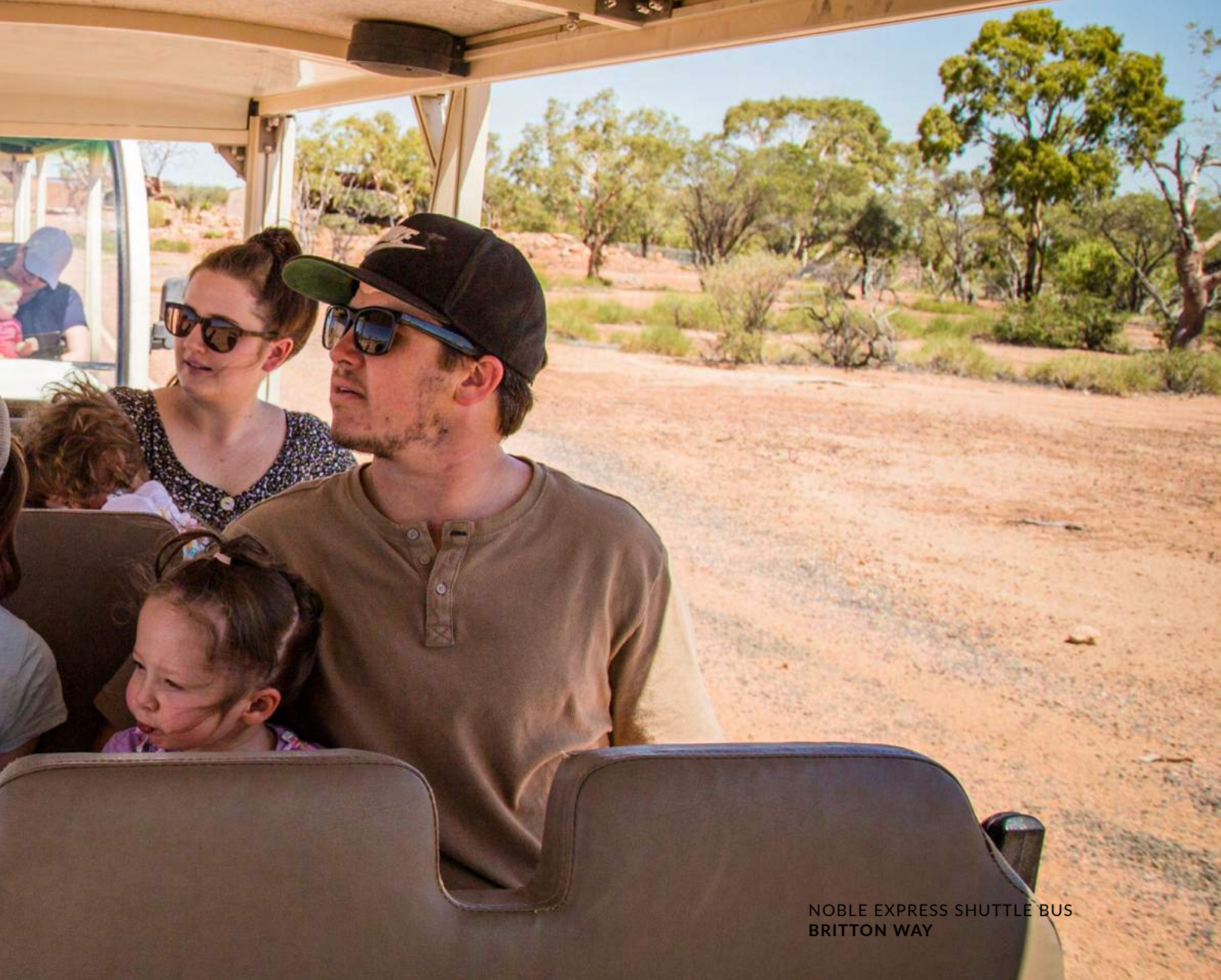
NOBLE EXPRESS SHUTTLE BUS BRITTON WAY